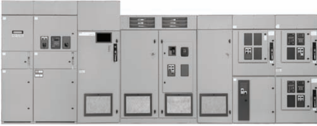
AMPGARD Motor Control Assembly with Main Breaker, SC 9000 AFD, RVSS and Two-High FVNR