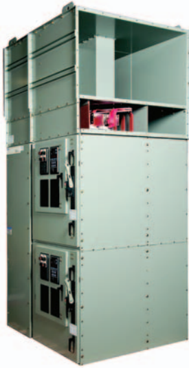
Arc Resistant AMPGARD